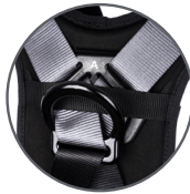
Front, rear, side & ventral attachment points