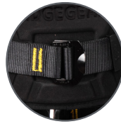
Rear waist adjuster for repositioning of side D rings