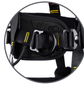
Work positioning D rings