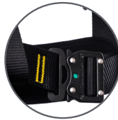
Adjustable fast fit buckles on leg and front chest straps