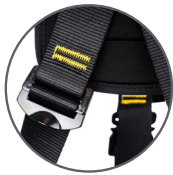
Back & shoulder adjuster