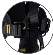
Double front waist adjustable