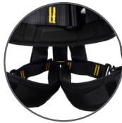
Waist, leg & shoulder support pads