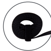
Hook and loop webbing tidy